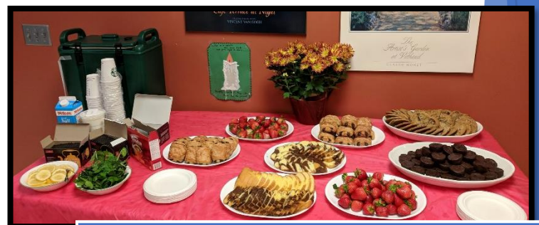
SURPRISE! Starbucks coffee and treats in the staffroom