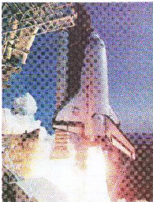
NASA Image Gallery